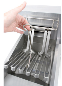
Combines swing-up elements with controlled burn-off cleaning (RE14 illustrated). Lift handle not available on 22 kW split pot element assembly.

8700 Line Avenue 71106 P. O. Box 51000 71135-1000 Shreveport, LA USA