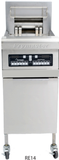
RE14 Shown with optional computer and casters