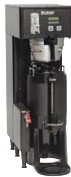
BrewWISE Single TF