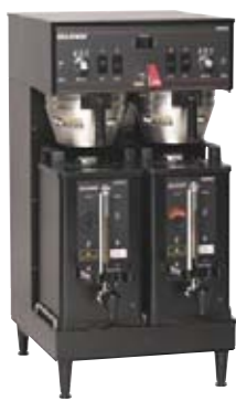
BrewWISE Dual SH DBC

Check out the complete line of BrewWISE beverage equipment at www.bunn.com .