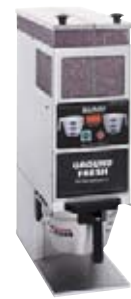
BrewWISE G9-2T DBC