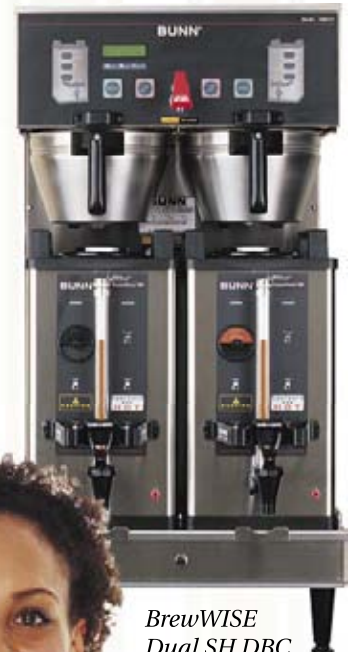
BrewWISE Dual SH DBC (server sold separately)