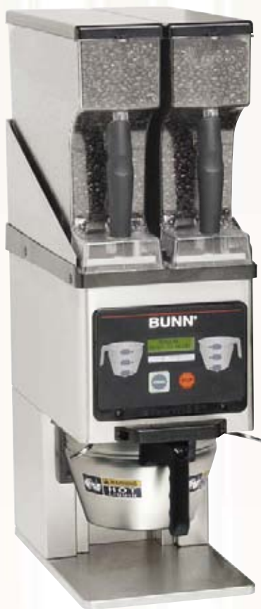
Multi-Hopper Grinder (funnel sold separately) (additional hoppers available)

Smart Funnel® and BrewWISE® technology makes it easy to focus on your customer's needs. Transfer information from grinder to brewer using the Smart Funnel. When the funnel is placed in the BrewWISE brewer, information is communicated and the brewing process begins.