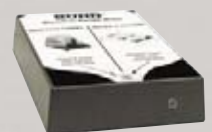
BrewWISE Recipe Writer

BrewWISE Recipe Writer The BrewWISE Recipe Writer allows you to create custom coffee recipe cards, messages that display on the brewer LCD and program dedicated funnels for special coffees.