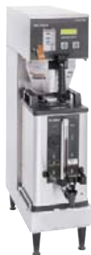
BrewWISE Single SH DBC