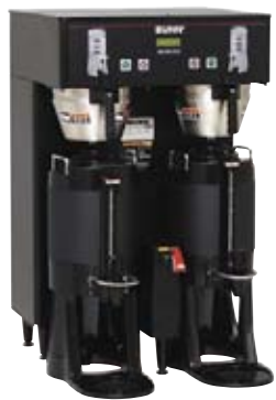
BrewWISE Dual TF