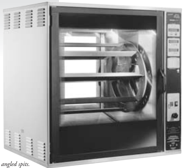
SCR-8 with eight angled spits.