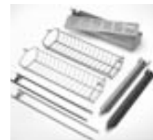
Above: Piercing spits, wire baskets, solid bottom basket with grid, angled spits.