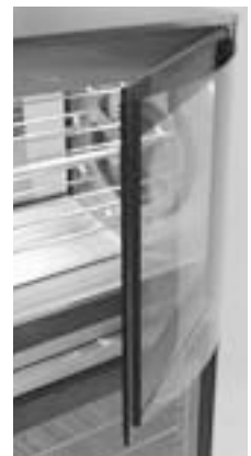
Right: Curved glass outer door.