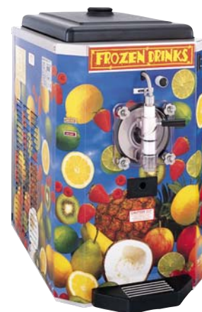
Shown with optional panel decals