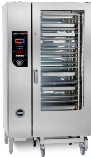
SmartCombi model ESC-215

The ESC/GSC-215 has a capacity of (20) full-size steam table pans 2 ½ in. (65 mm) or (20) Crosswise Plus pans and grids.