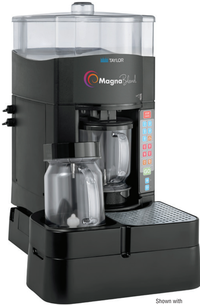
Shown with standard ice hopper