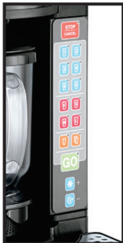
Shown with 6 recipe buttons on international models only